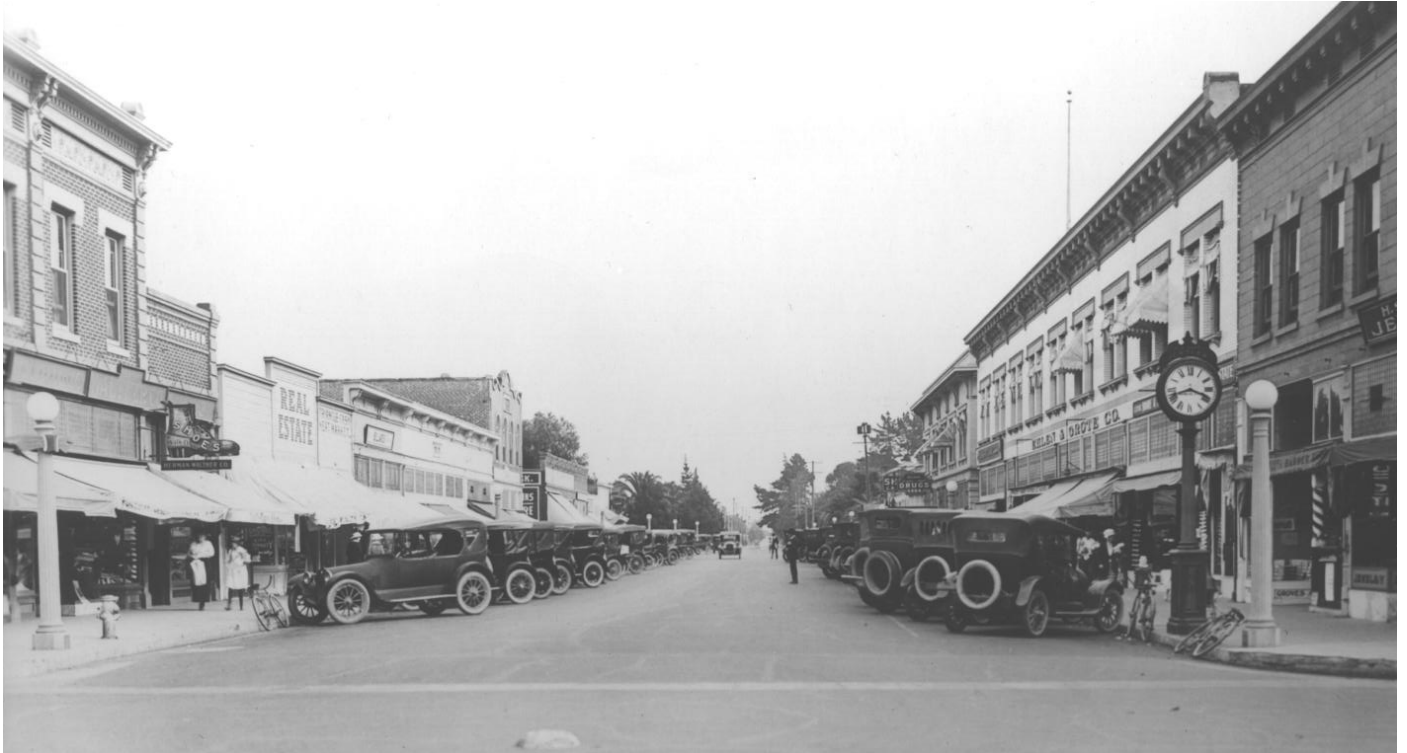
The City of Orange, looking south along Glassell Street from the Plaza toward Almond Street. The photo was taken in 1922. The large clock on the right was in later years moved around the corner to the right. It remains there today.