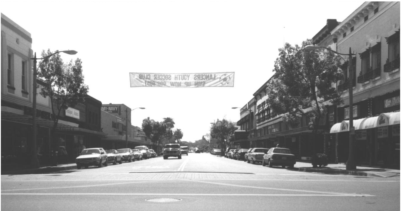
The same view in 1993. Photo by Tom Endy #2479