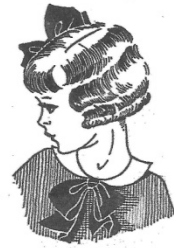
"Miss Junior" Wave

"Crowning glory" into short "Bob's" (hair worn short and close to the head). First seen as straight with bangs, it evolved to softer waved styles. They were achieved with a heated "Marcel iron", pin curls