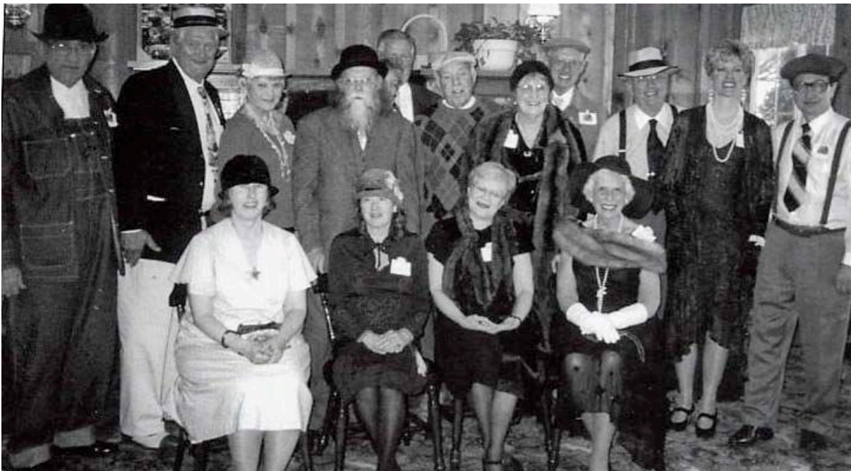
Salt Creek A's enjoying era fashions