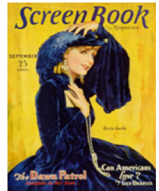
Garbo in the "hat that started it all," 1930.

The Empress Eugenie had been the wife of Napoleon III, who ruled France from 1853 to 1871. She set the original fad for a little perched hat with a plume back in 1860. Seventy years later, another widely influential trend setter, Greta Garbo, was credited with (or blamed for) having revived the fashion when she wore an "Empress Eugenie hat" in the 1930 movie Romance . Felt and velvet were the favored materials, with black, "mascara brown," "kiltie green" and "brandy wine" being the favored colors for fall. The regard for romantic, old-fashioned styles carried over into other accessories that season too – from French Colonial-influenced shoes to Victorian revival jewelry, from "Empress Eugenie" miniatures to cameos. Beauty salons were quick to offer "Empress Eugenie" hair styles, also.