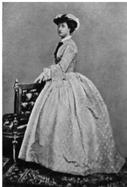
Empress Eugenie of France, 1865.