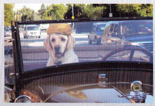
How about making a new "friend"...

Have you ever found yourself admiring "old cars" and wondering what it would be like to drive one; .... or,.... even to own one....????