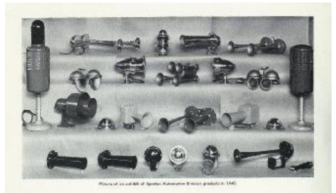
Display of Sparton Automotive products Circa 1940