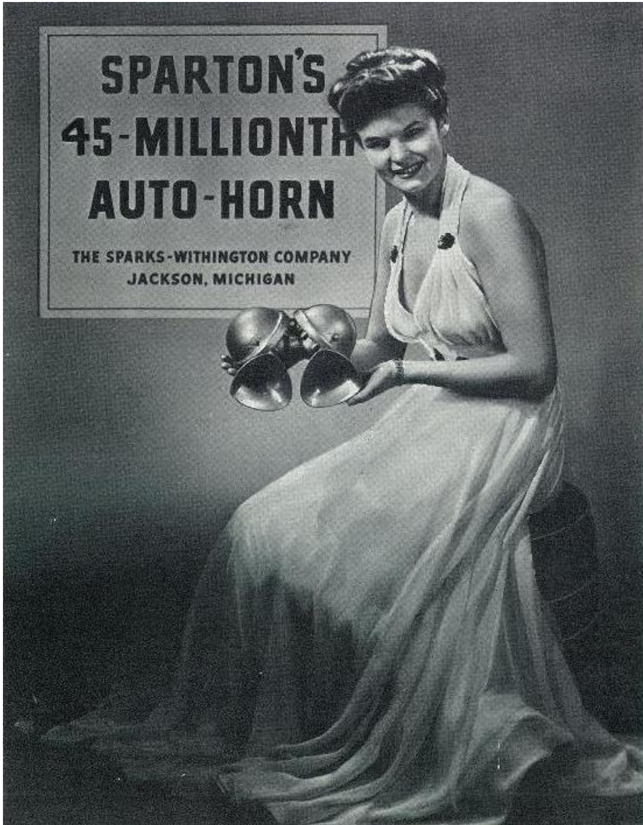
Spartons 45 - Millionth Horn Advertisement - circa 1950