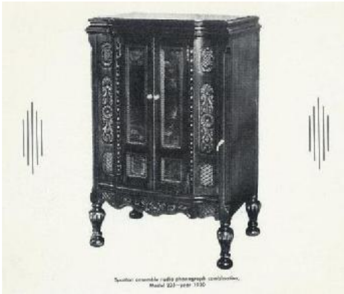
Sparton Combination Radio-Phonograph - Year 1930

over 42 makes of cars had Sparton motor horns. Although Lincoln is on this list ( presumably before Henry Leland sold the company to Ford ) Ford does not appear - yet. Another nugget from the 1920s. Sparton sold a series of horns called the "Bugle" which played various tunes. A song was written about them ( without, however, mentioning Sparton's name in the lyrics ) called "I'm Wild About Horns on Automobiles That Go Ta-Ta-Ta-Taa". In the record, an actual horn makes the sound. In 1926 Sparton entered the radio business, and in 1927 moved into a much larger building in Jackson.