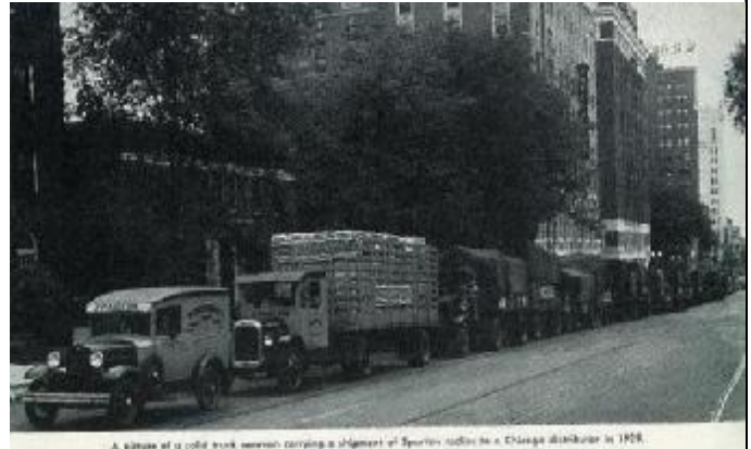
Caravan of Trucks led by a Model A, delivering Sparton radios to a Chicago Distributor in 1929