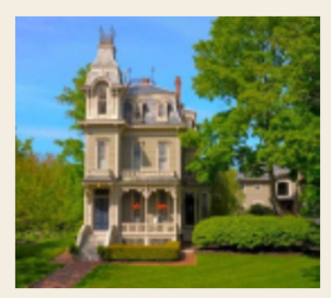
George Lord Little House