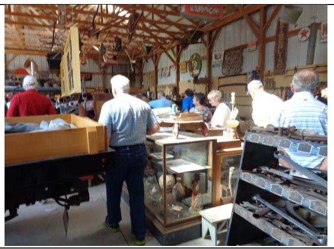
More digging for those great finds.