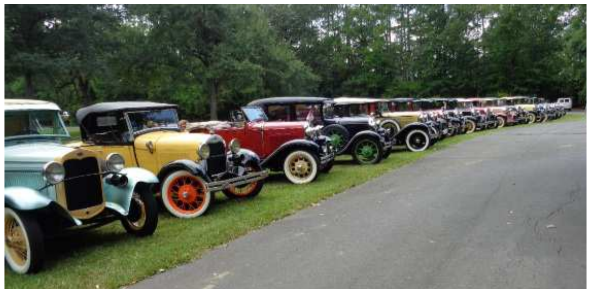
Lined Up at the Berry College Campus

The Forth, but not necessarily annual, Fun with Dick and Jane Tour got off to a good start on Friday with attendees arriving safely at the Hawthorne Hotel for check in. The Hawthorne Hotel is a restored 1890's warehouse with original wooden floors and brick walls, located in the historic district of Rome, Georgia. What a great turn out; 56 members and guests; 27 Model "A" Fords with attendees coming from Alabama, Florida, Georgia, and Tennessee!