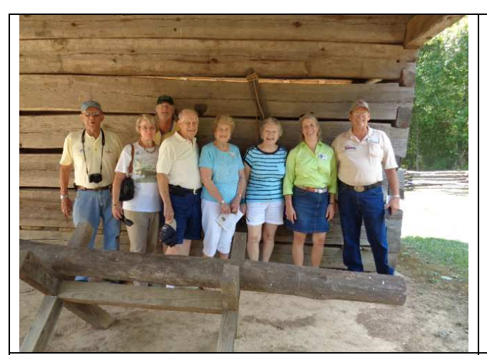
Members touring the New Echota Village.