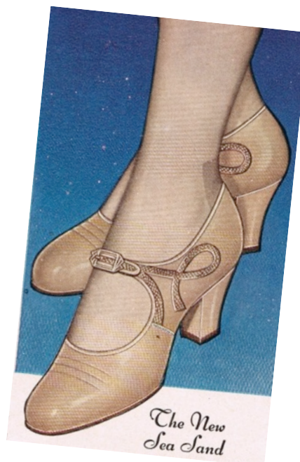
The New Sea Sand